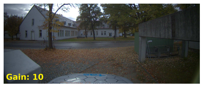
The same scene for different Gain and a fixed exposure time of 2000us.

Gain adjusts how sensitive the image sensor converts incoming electrons to brightness in the image. Raising the gain value is another way to bright up a low-light environment at the risk of adding random noise. In most cases during daylight it is recommended to maximize the exposure time as much as possible to illuminate an image and to keep the gain value as low as possible.