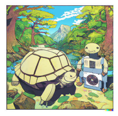
DALL-E 2 hallucinating to the prompt: Japanese album cover of an anthropomorphic turtle walking hand-in-hand with a robot in a nice scenery.