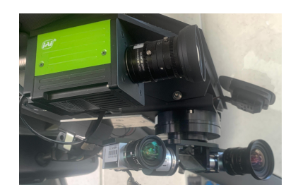
JAI FS 3200D ( ) is a prism camera holding two image sensors.