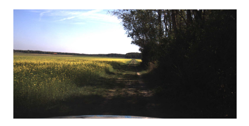
Under these challenging lighting coniditions, the camera produces an image underexposed along the path (see right).